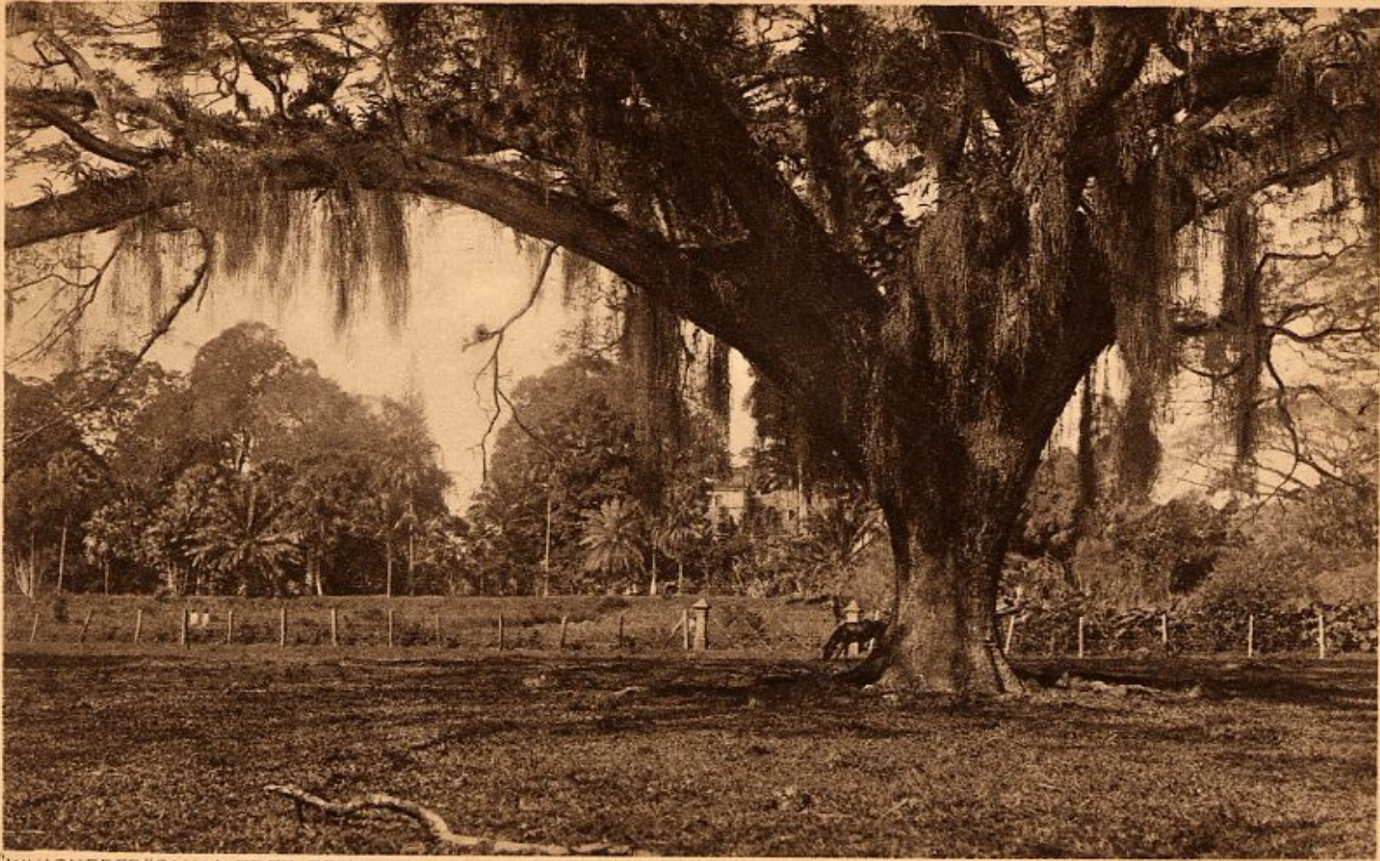
"WHISKERED" SAMAN TREE, TRINIDAD.