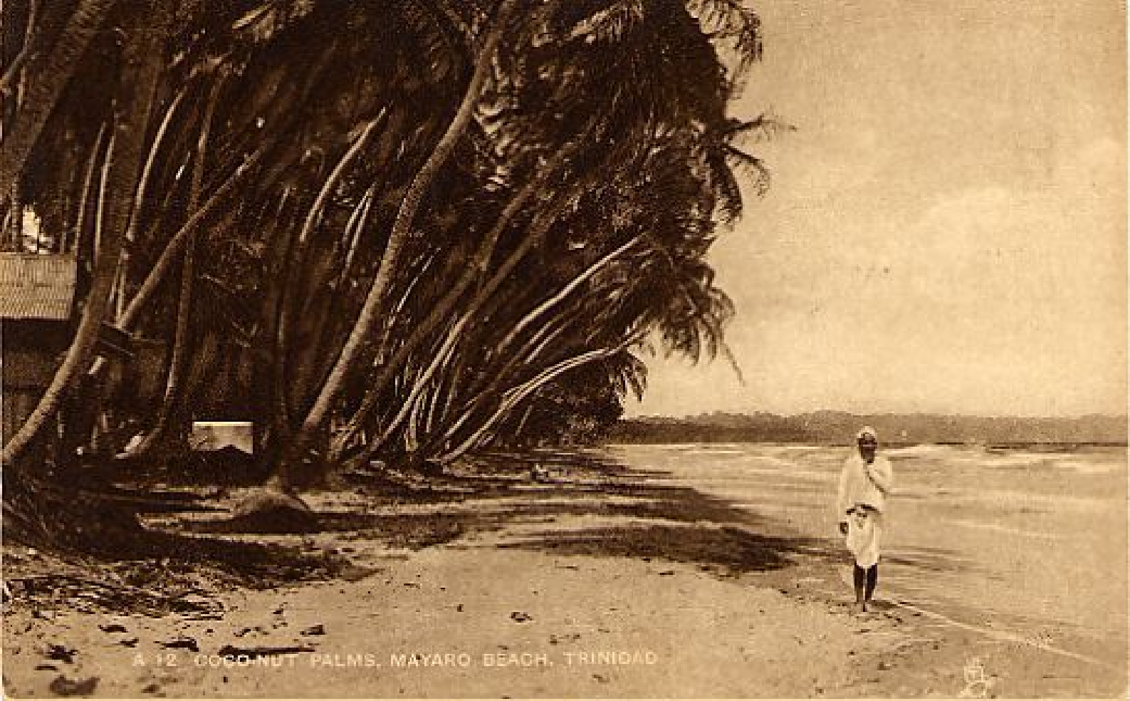
A 12 COCONUT PALMS, MAYARO BEACH, TRINIDAD