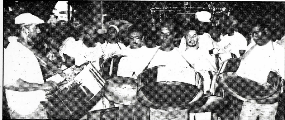
SCRUNTERS PAN GROOVE , one of the more entertaining pan-round-neck steelbands