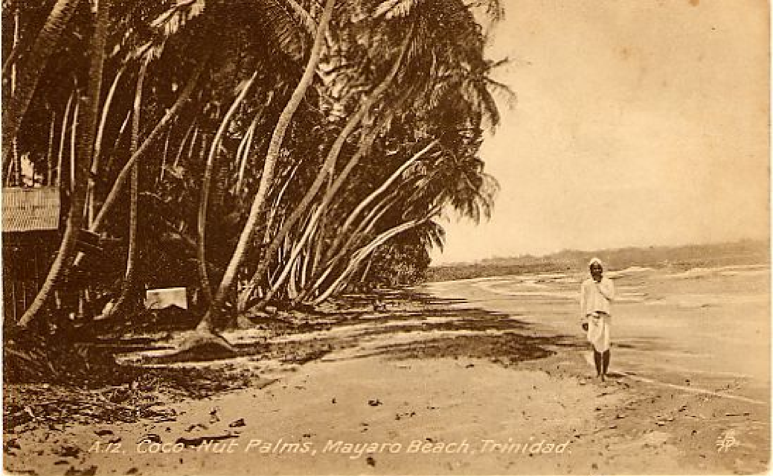
Aiz. Coco-Nut Palms, Mayaro Beach, Trinidad.