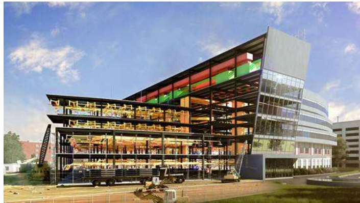
Figure 10: Building information model (BIM)

platform for working in a computer generated virtual environment where various software application and information technology (IT) tools can be used to design buildings [3], by a variety of consultants. BIM differs from the previous versions of CAD technology in that users input parameters for example, the thickness of a concrete slab, into the software in order to generate a visual representation of an object instead of drawing the object using vector coordinates. Figure 1 shows an example of an advanced BIM model.