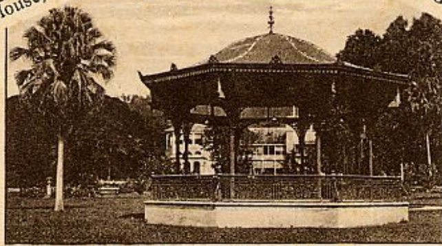
Music Pavilion, Botanic Garden