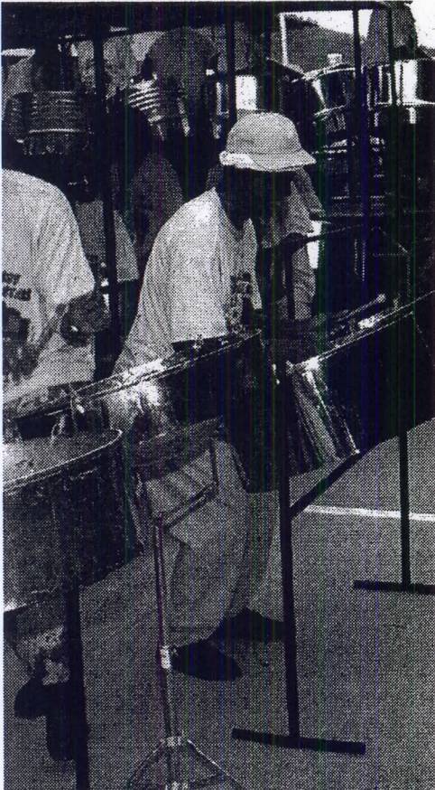
All Stars players have a ball performing "Sweet and Sexy" at the Panorama North Zone Finals, yesterday.