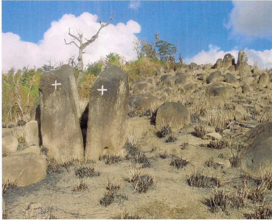
Figure 2. A pair of ‘female stones in the stone array (Photograph taken by A. Atwell and reproduced by permission).

Al Hajji Talib Ahmad Dawud (1971) presented a paper entitled Greencastle Hill, Antigua: A possible Monument of a Prehistoric Civilization at the Fourth International Congress for the Study of Pre-Columbian Cultures of the Lesser Antilles. He described these unusual megaliths and other stones which he considered to be altars and “sacrificial slabs.” He also noted an isolated stone on the western edge of the plateau from which alignments could be made to numerous stone columns which suggested that it could have been used as an ‘observation stone.’ This spectacular array of stone columns subsequently stimulated considerable discussion about the possible function of the array and the discovery of an adorno on the hill indicated a Ceramic-age Amerindian presence. A preliminary archaeological investigation of the site, directed by archaeologist Dr. R. Murphy in 1995, included an examination of all objects excavated that were seen to be modified by humans or used in human activity. This cultural material was only found on the slopes of the hill, indicating that the flat summit may have been an “activity area.” It was observed (Forrest 1935) that the artefacts were typical of the terminal to post-Saladoid cultural affiliation ca.AD 900 to 1200, classified by Caribbean archaeologists as Mamorean Troumassoids (Reid 2009). By A.D. 1200, this cultural group had evolved to become Eastern Taínos (Reid 2009).