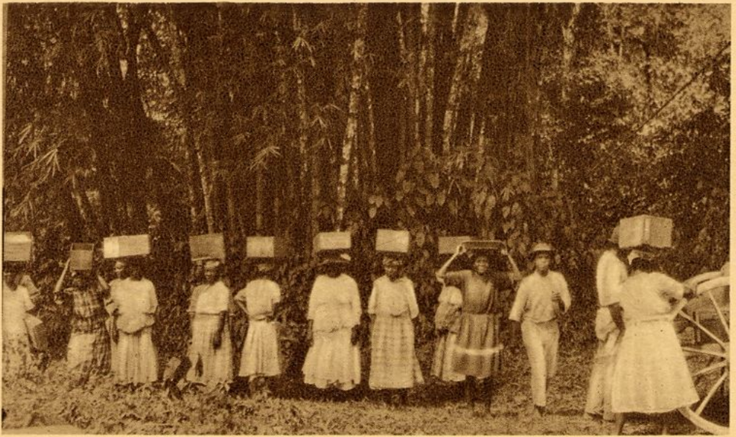
NATIVE BURDEN BEARERS IN TRINIDAD