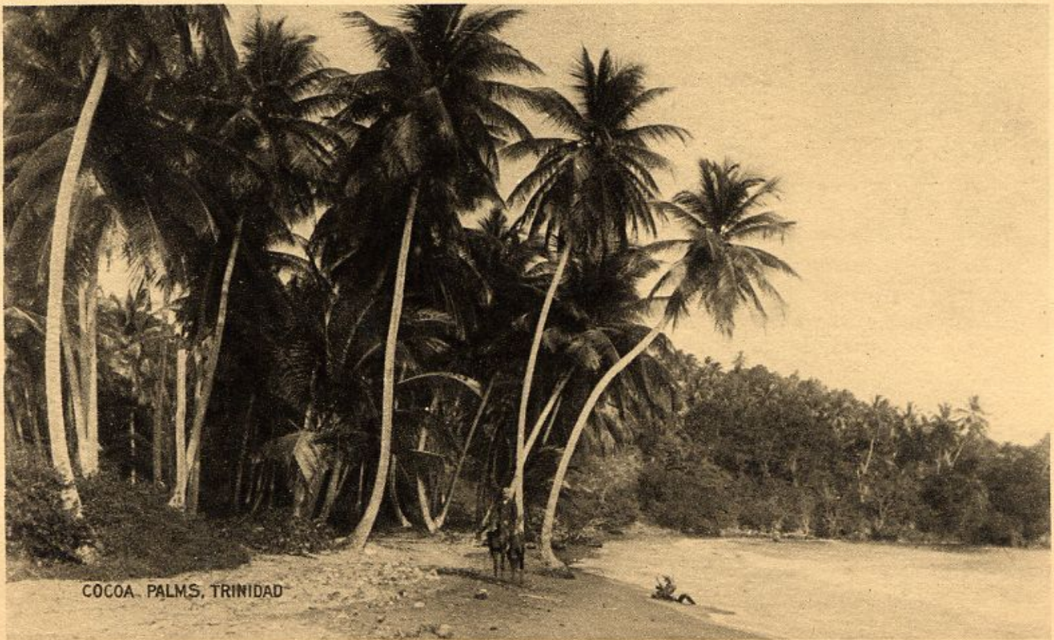
COCOA PALMS, TRINIDAD