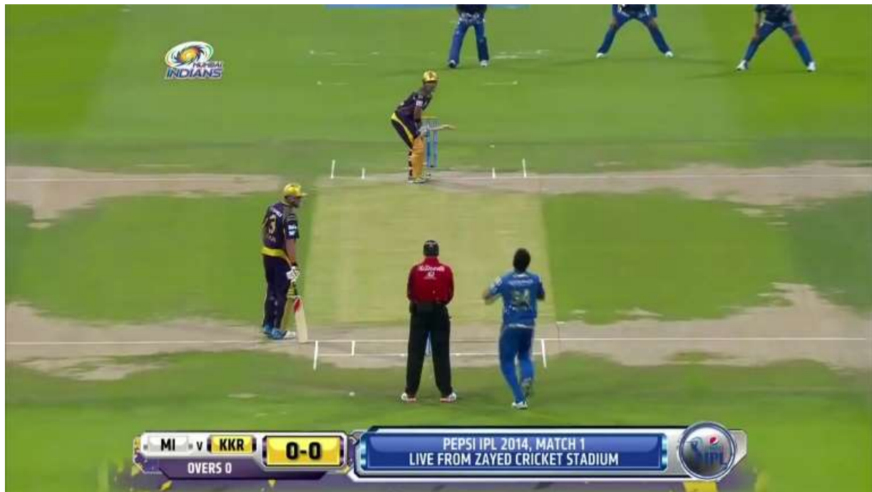
Figure 18: Sample of Training Frame with a left arm fast bowler over the wicket to a left hand batsman

Figure 2 shows an example of the variation of training frames. False detections would cause a failure for the combination of video and extracted text-based metadata. To eliminate the usage of false detection results, the user would verify each candidate BRS from an automated prompt.