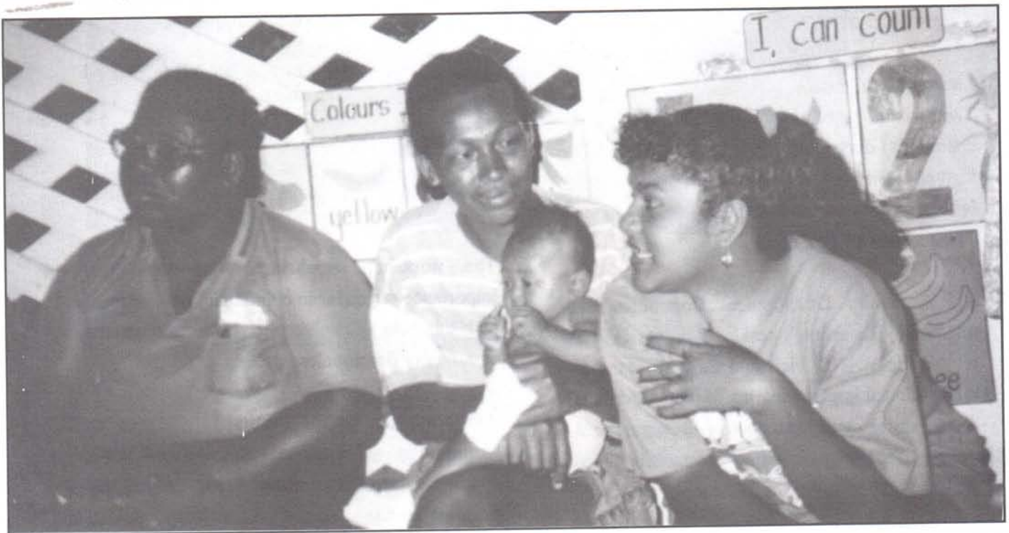
A discussion in Kawkwami, Guyana takes place during a CORE introductory visit. Red Thread has developed health, research and popular education teams from within its membership.

The training was initiated to assist in an integrated approach in the organisation and management of environmentally sustainable water supply and sanitation systems by training of trainers on women's needs as well as their