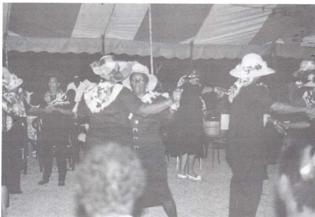
Soroptomists dancing away under the Women's Tent (above)

■ Recommendations from GROOTS Workshop, SIDS April 1994, Barbados.