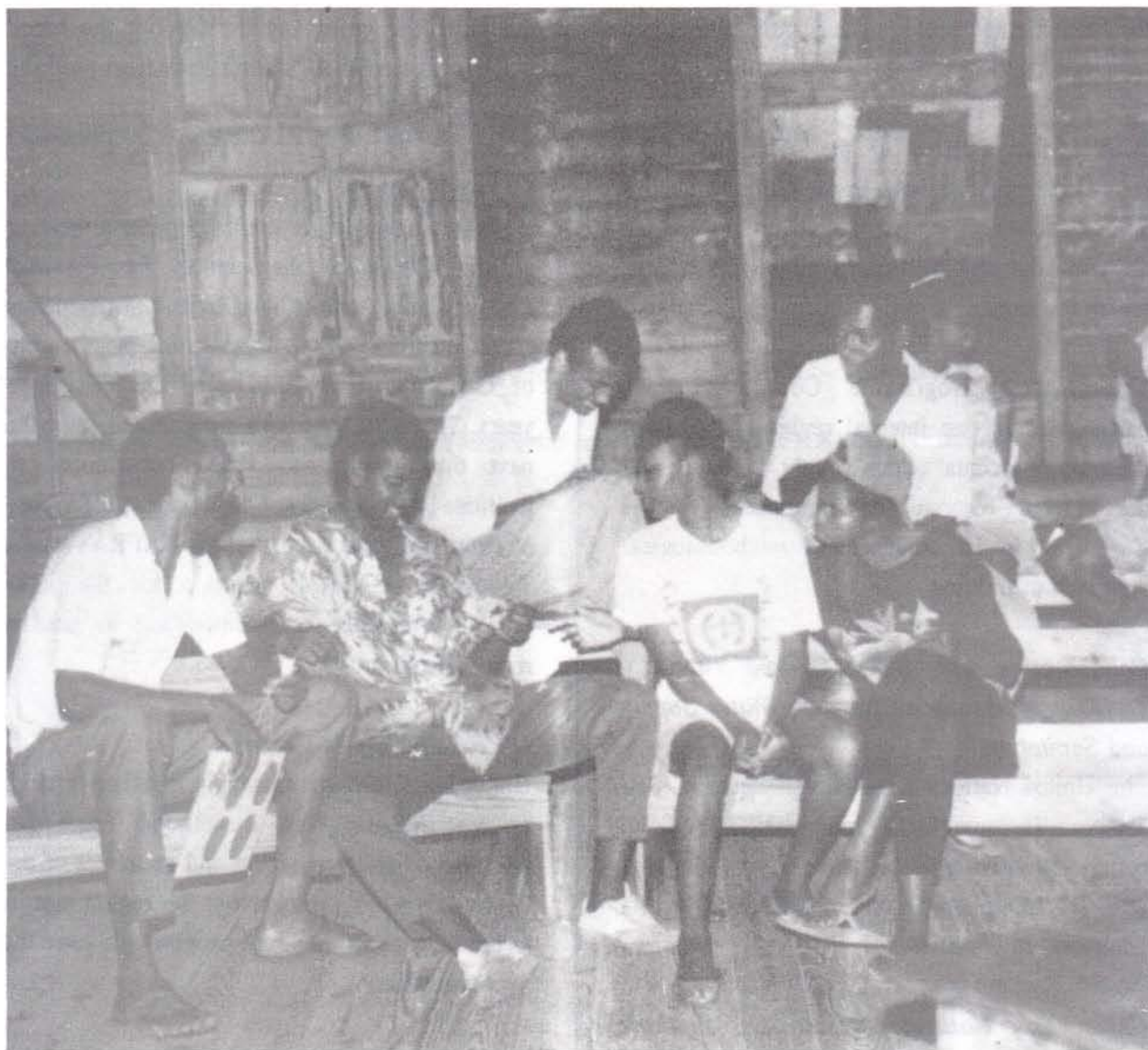
The Mount Horne, Grenada Youth Group work out an activity during a workshop facilitated by WAND. At that time meetings were held in the old school building in Mt. Horne. Since then residents have constructed a new centre with the help of people from Apres Toute.

WAND participated in this workshop as a member of the resource team.