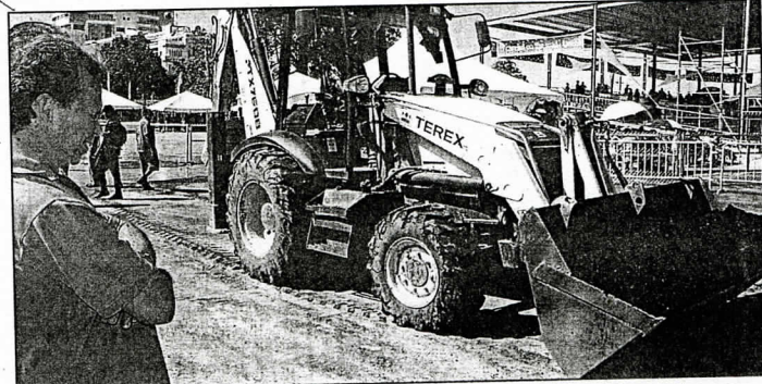
Minister of Works and Transport Colm Imbert looks on as a backhoe operator carries out paving works on the western end of the Savannah where the bands were to exit.