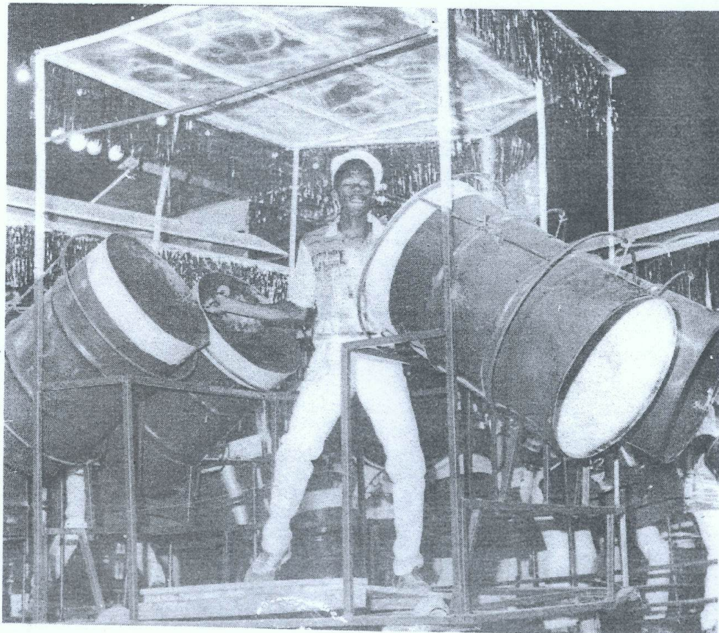
The ecstatic bassman is from Tornadoes

In at 3-1 odds is the 1982 Steelband Festival winner,