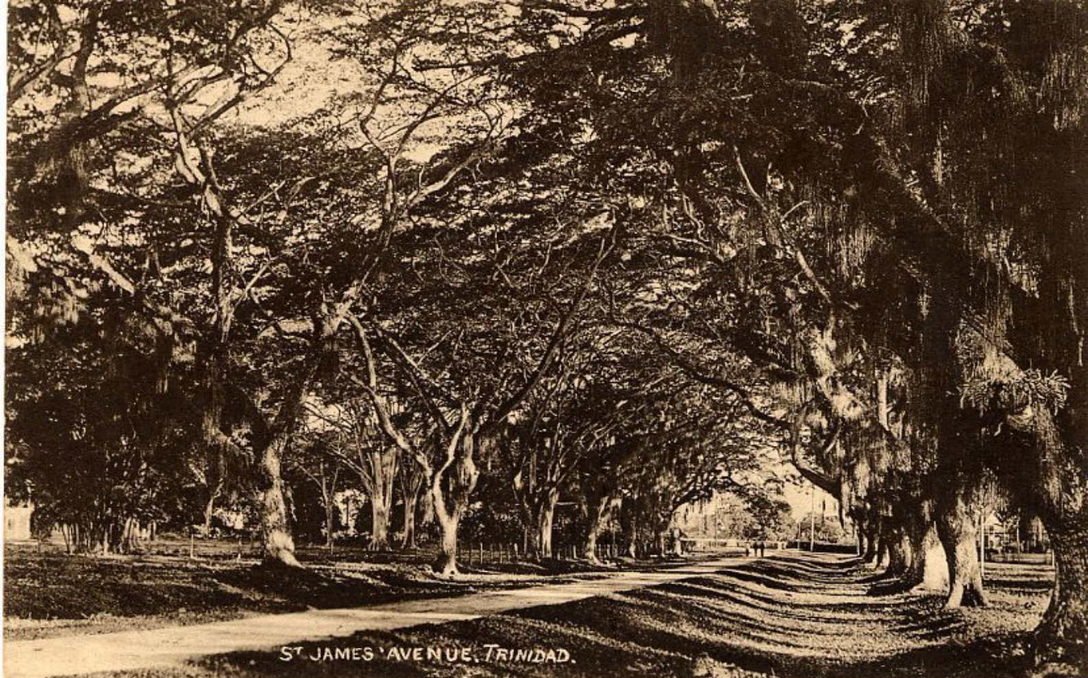
ST. JAMES AVENUE, TRINIDAD.