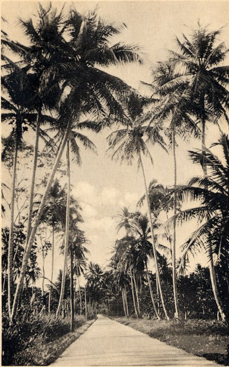
Coconut Avenue, Trinidad, B.W.I.