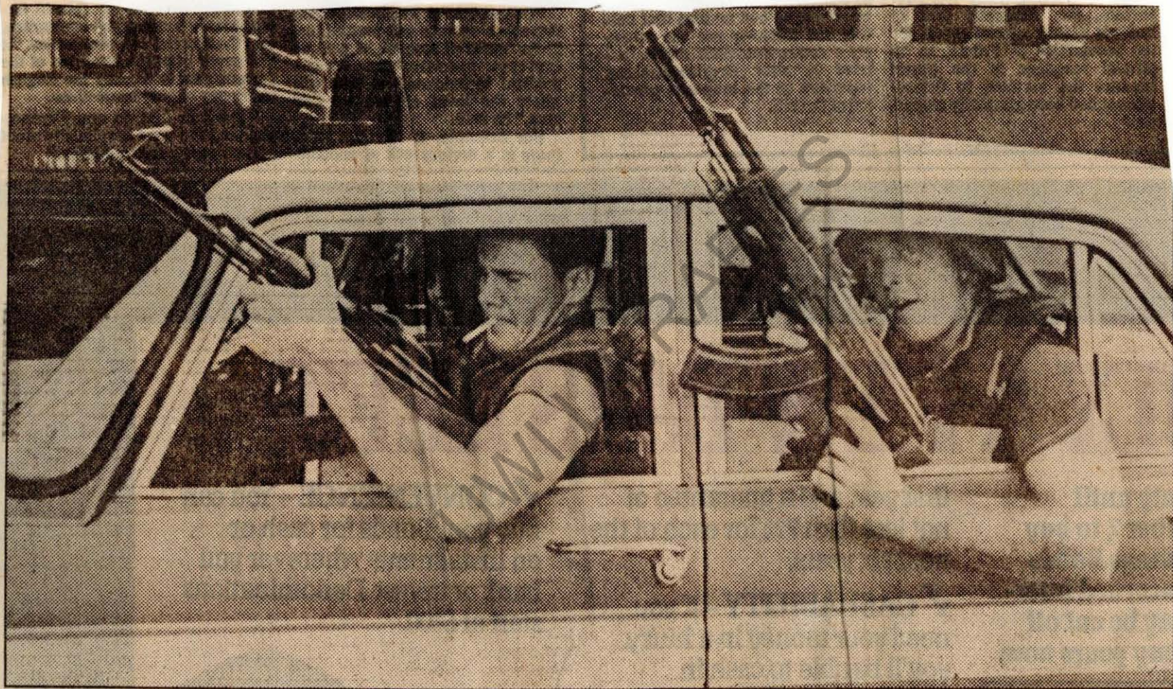
U.S. soldiers brandish captured rifles from windows of civilian vehicle near Point Salines Airport in Grenada.