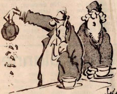
I bet you didn't remember this is the same coffee shop where we met 25 years ago.

© 1983 Universal Press Syndicate 10-28 Linton