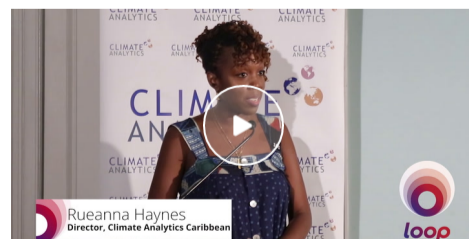
Climate Analytics Caribbean: Advancing climate action for our islands