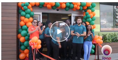
One-stop shop: Presto Market launches range of fresh produce in Arima