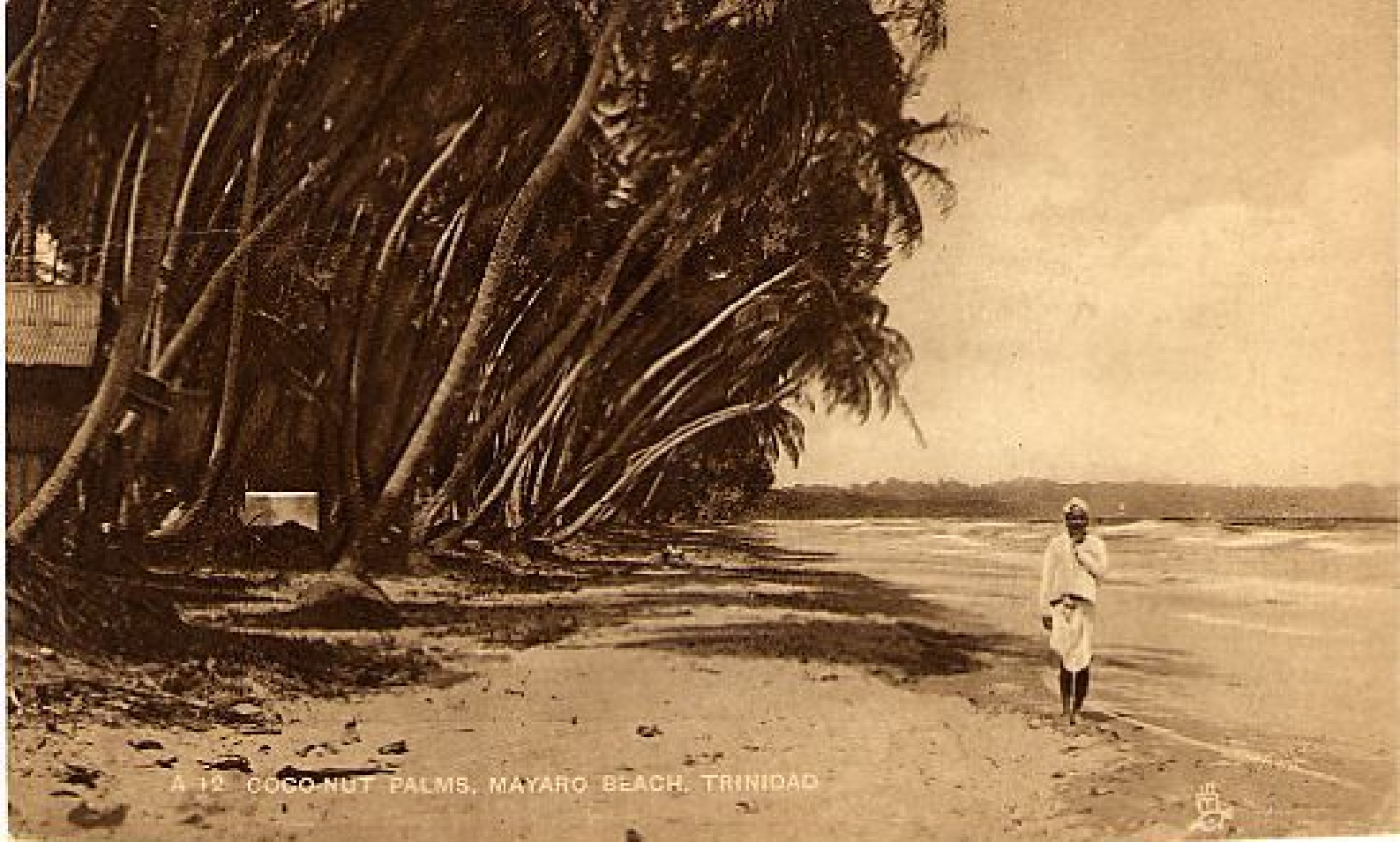
A 12 COCONUT PALMS, MAYARO BEACH, TRINIDAD