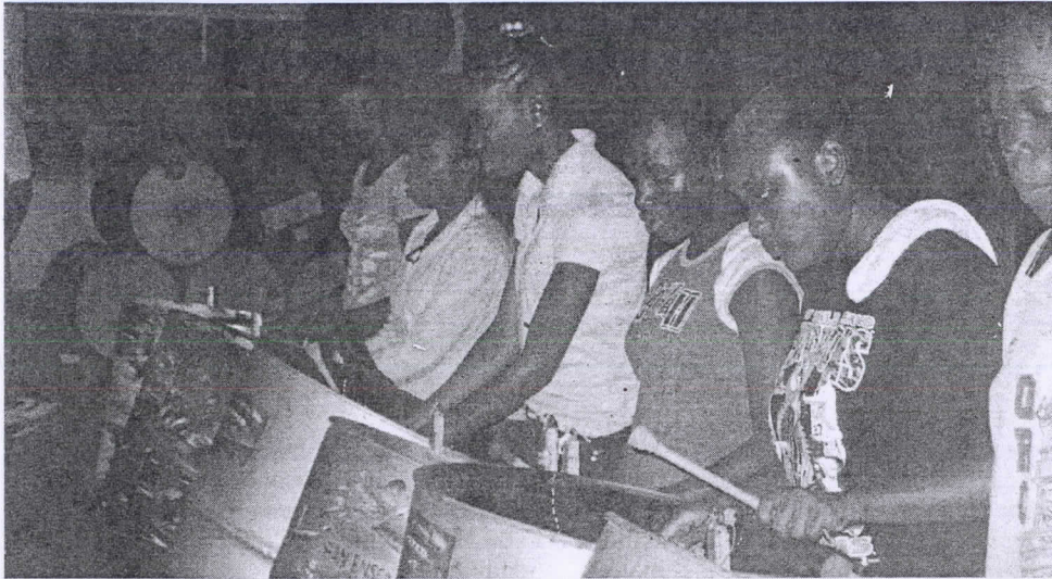
LADIES ROW: These girls practice at the Merrytones Pan Complex on Monday night.