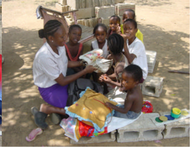
Roving Caregivers working with children on a home visit