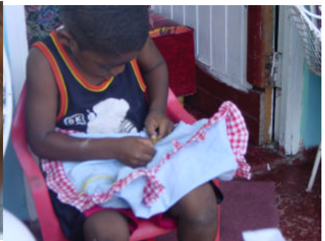
Manipulables produced by parents with the help of Rovers