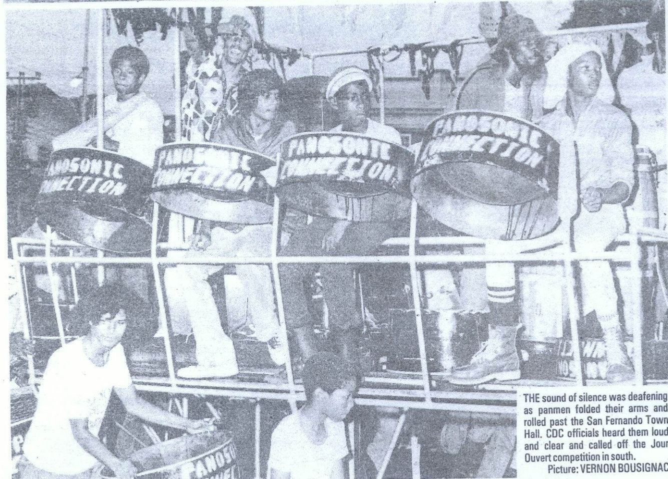
THE sound of silence was deafening as panmen folded their arms and rolled past the San Fernando Town Hall. CDC officials heard them loud and clear and called off the Jour Ouvert competition in south.