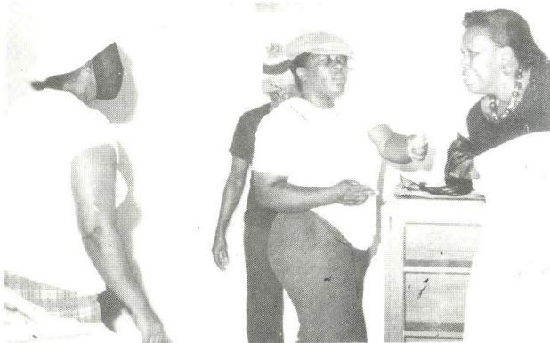
RAPIST AND VICTIMS: SISTREN perform skit on Sexual abuse at A PEOPLE CULTURAL FESTIVAL ON THE ARTS AND HUMAN RIGHTS

A very special word of appreciation to the hundreds of workshop participants who formed the heart and soul of our memorable 1984 ISLAND TOUR.