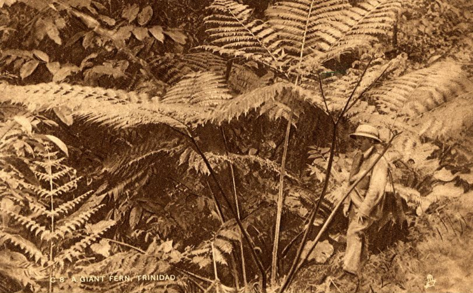
C 8 A GIANT FERN, TRINIDAD