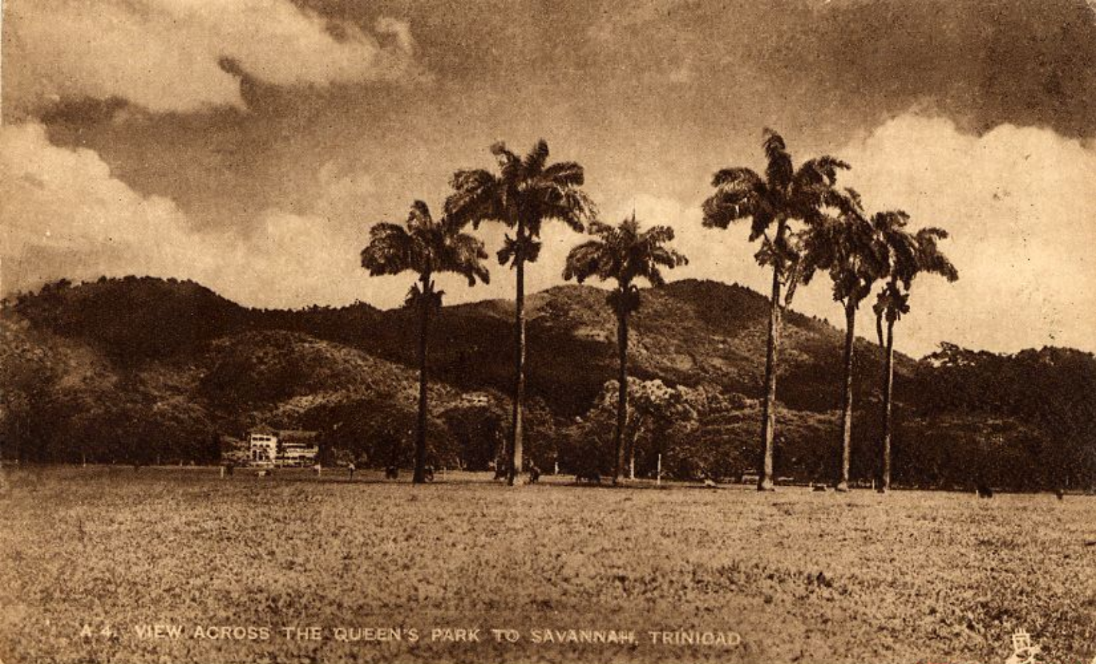
A 4. VIEW ACROSS THE QUEEN'S PARK TO SAVANNAH, TRINIDAD