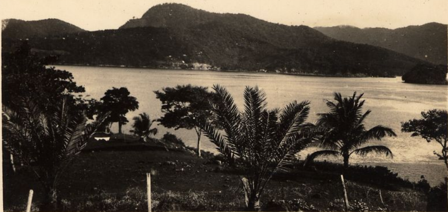
36 TRINIDAD, B.W I