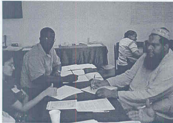
Participants engaged in discussion in a small group session, Creative Strategies Workshop, Mayaro

The target groups were teachers and principals of secondary schools. The workshops are being implemented according to the eight Educational Districts in Trinidad and Tobago, one workshop per district.