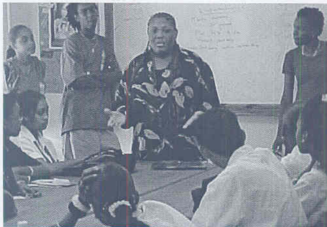
RAPPORT facilitators engaging students in a discussion on Sexuality and HIV/AIDS

The Centre participated in the UWI's (University of the West Indies) annual Open Days, in which the University "opens" its doors to secondary schools and the general public, with a very successful booth display and programme of activities held at the Centre's Seminar Room. This year activities included rap sessions on HIV/AIDS and sexuality facilitated by Rapport of the Ministry of Health. This group is an outreach and education arm of the Ministry on HIV/AIDS and is staffed primarily by young women and men who use popular theatre methodology to educate young people on HIV/AIDS.