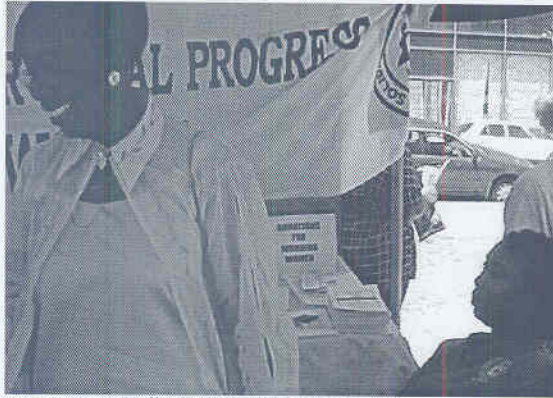
Senator Joan Yuille Williams, Hon. Minister of Community Development and Gender Affairs shares a light moment with members of Working Women and the CGDS/WDSG booth at IWD, 2003.

Women). The event was very successful with members of the public as well as Government officials visiting the booths during the course of the day. The annual lunch-time march through the streets of Port of Spain was also well-supported. Below are some images of the day's activities.