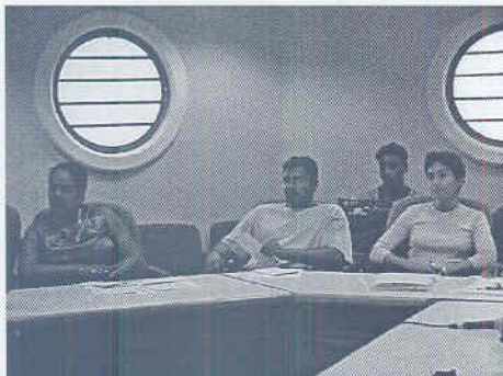
Cross- section of participants at the WDSG How to Publish Workshop.