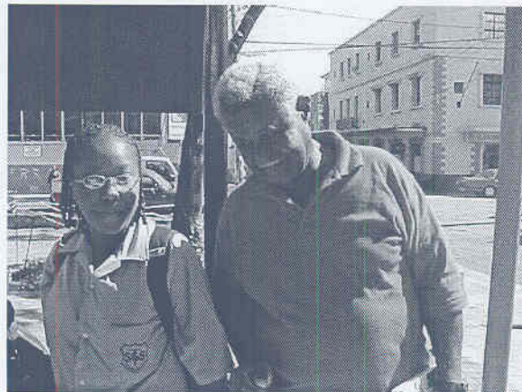
Two generations and genders share thoughts at the CGDS/WDSG booth for International Women's Day, 2003.