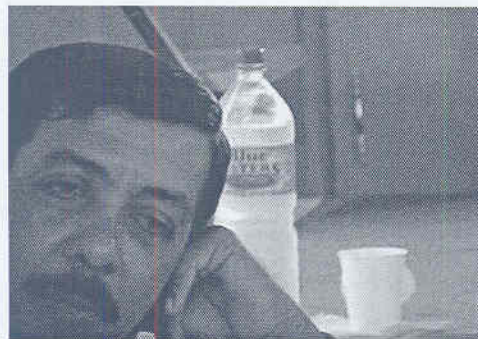
Teacher from Rio Claro Secondary School contemplating the words of the facilitator at the Creative Strategies workshop, Mayaro, 2002