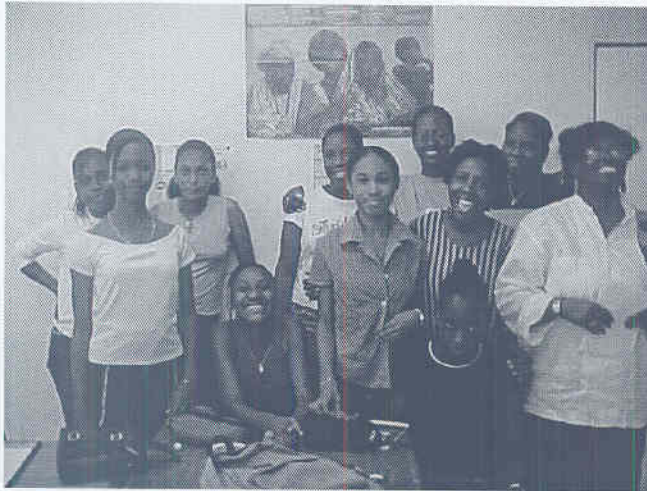
Some members of WINAD's mentor programme gather at one of the sessions.

The Network of Non-governmental Organisations For the Advancement of Women (the Network) is an umbrella organization comprising various organizations. It serves to facilitate networking among NGOs and CBOs and provides services such as workshops that seek to empower women, advocacy and lobbying skills. The Network traditionally takes responsibility for organizing the annual International Women's Day activities. The Network was formed approximately 17 years ago and has recently conducted an evaluation and strategy exercise with its membership.