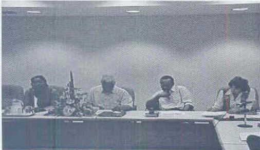
Members of the Head table at the Women and Development Studies, How To Publish Workshop .

Participants, mainly post- graduate research students were drawn from the various faculties – Agriculture and Natural Sciences, Social Sciences, International Relations and the Humanities. Among their recommendations they indicated that the WDSG should organize follow-up seminars or workshops related to the topics of publishing and accessing grants.