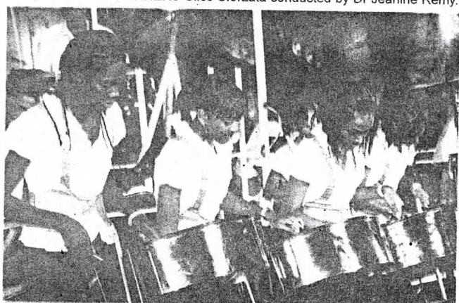
CODRINGTON Pan Family were joint second place winners.