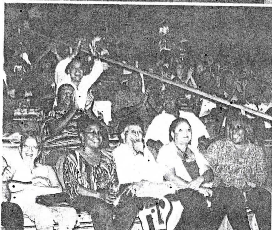
A SECTION of the crowd applauds lustily.