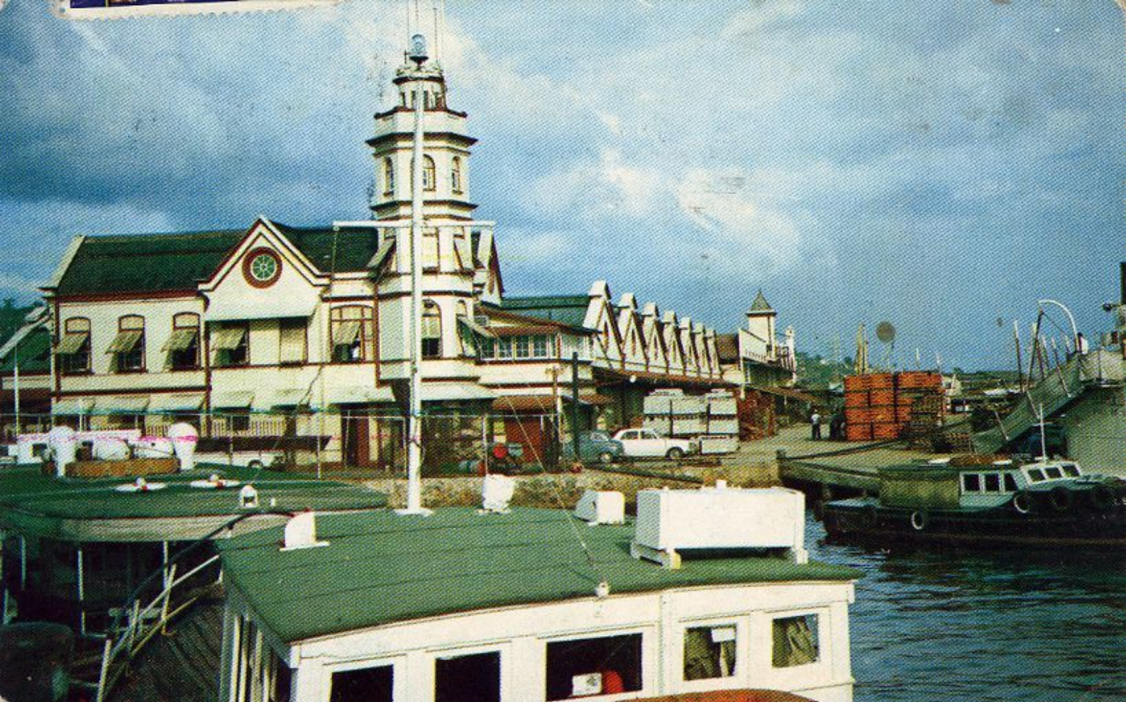
THE CUSTOMS HOUSE, Port-of-Spain, Trinidad, West Indies.

Greetings from Trinidad Hope things are going well. Tell everyone I said hello. See you soon.